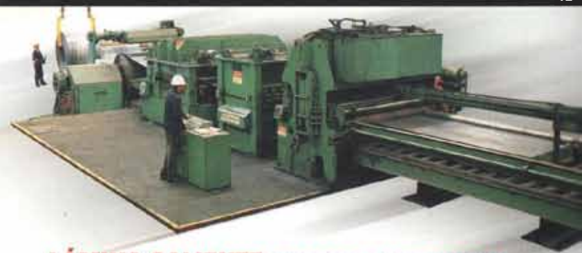
LÁMINA CALIENTE DECAPADA Y SIN DECAPAR